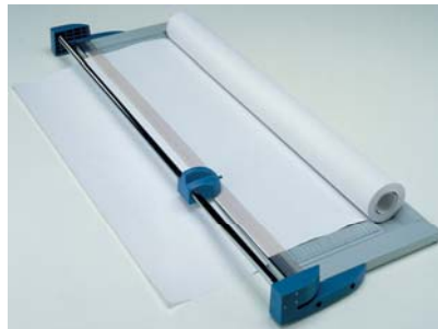
Convenient built-in paper rolls housing for easy cutting operations of large sizes of continuous paper